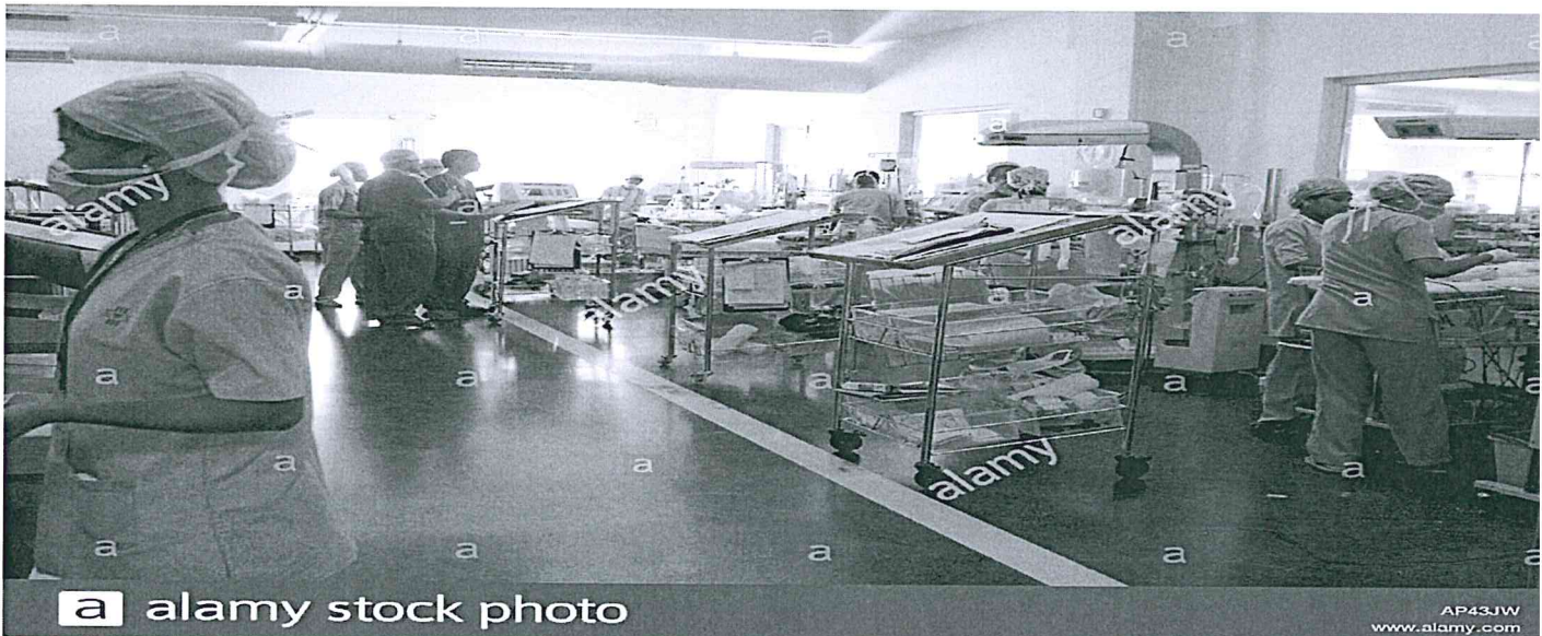
(Pediatric cardiac unit in Narayana Cardiac sciences)