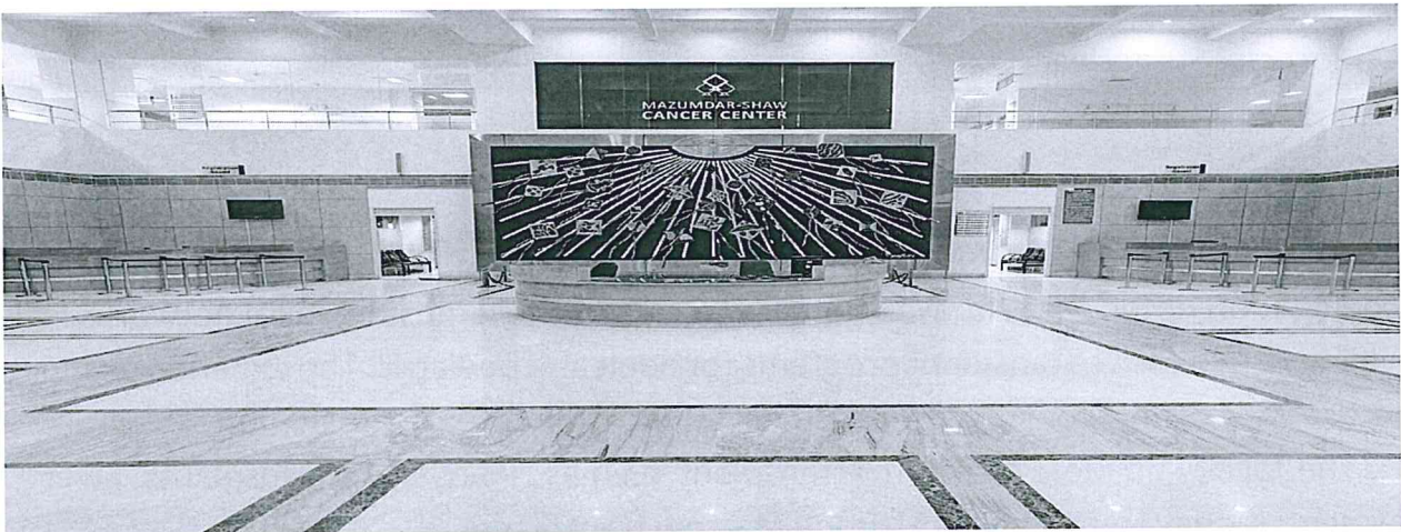
(Mazumdar shaw cancer center)

The MSCC runs a highly successful stem cell transplant program including a high-tech stem cell research center that specializes in head and neck cancer; Gastrointestinal cancer; Gynecology cancer; Ortho cancer; and, Urology cancer