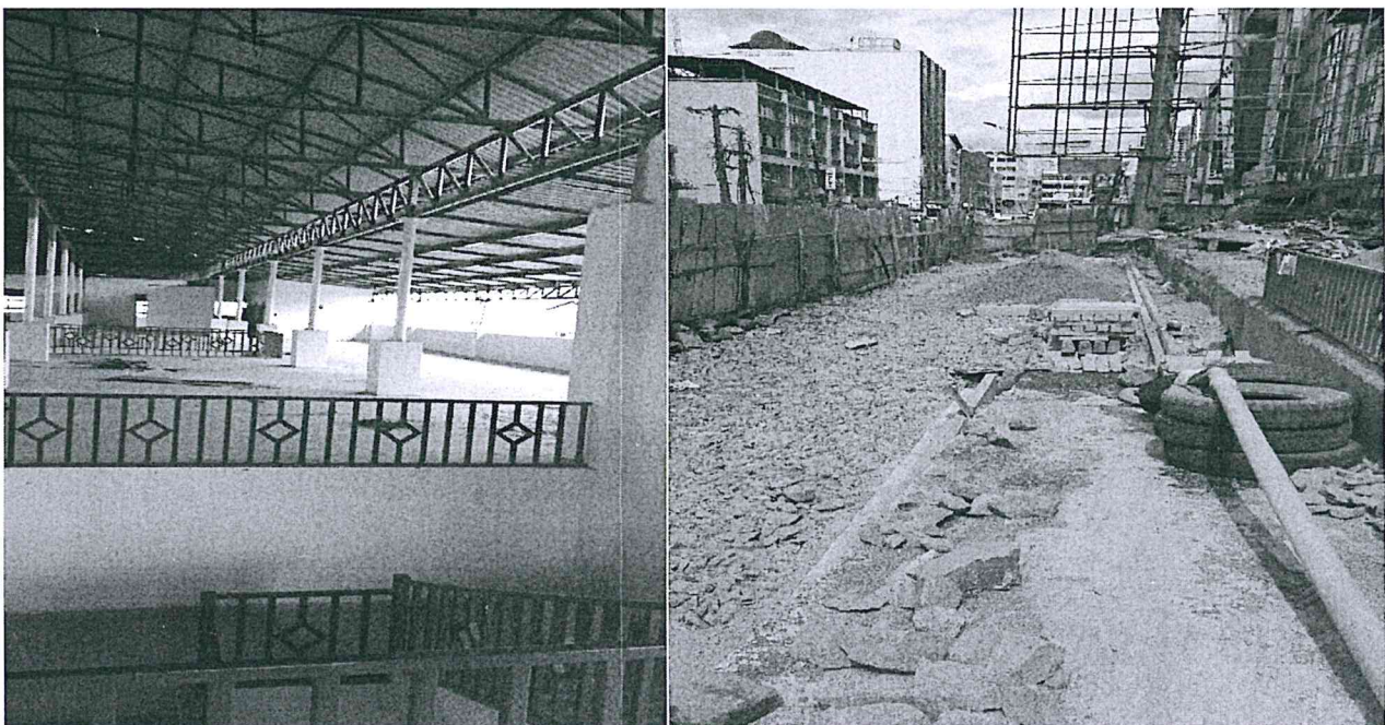
(Parts of the Westlands Market)