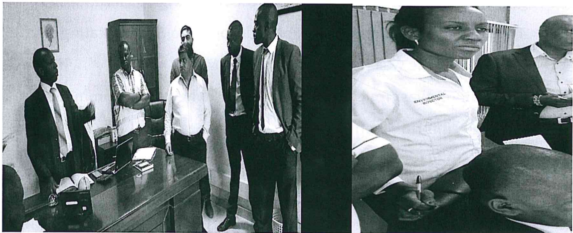
Powerex Ltd General Manager briefing the Committee on its operations