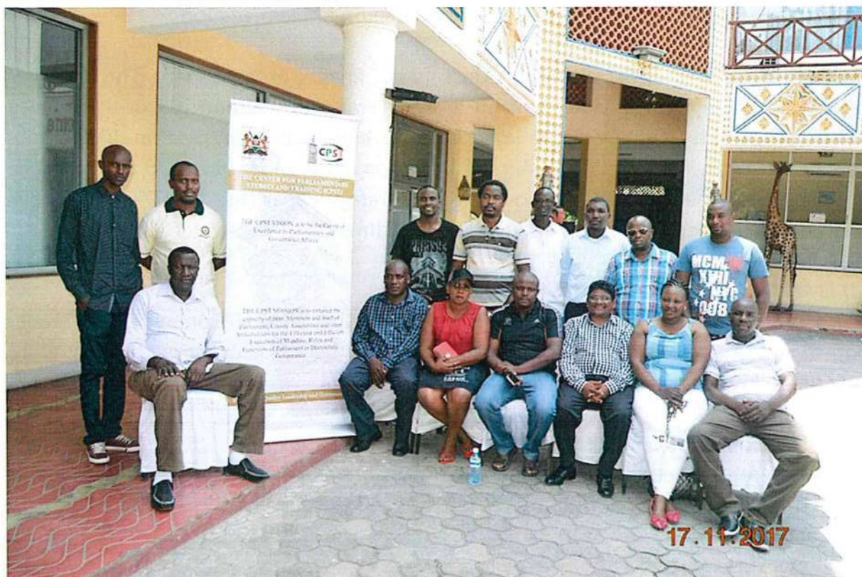
INDUCTION WORKSHOP FOR THE MEMBERS OF THE NAIROBI CITY COUNTY ASSEMBLY SECTORAL COMMITTEE ON TRADE, TOURISM AND COOPERATIVES HELD FROM 16 TH TO 19 TH NOVEMBER, 2017 AT SAI ROCK BEACH HOTEL, MOMBASA COUNTY