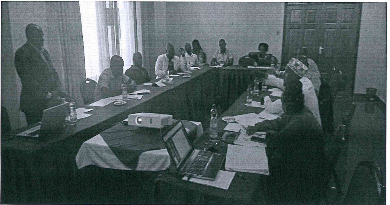
2 ND INDUCTION WORKSHOP FOR THE MEMBERS OF THE NAIROBI CITY COUNTY ASSEMBLY SELECT COMMITTEE ON WARDS DEVELOPMENT FUND HELD FROM 2 ND TO 5 TH MARCH, 2023 AT MAXLAND HOTEL, KIAMBU COUNTY.