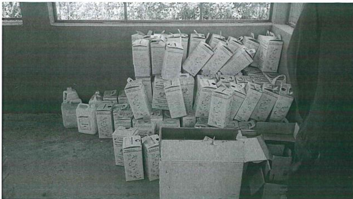
Waste stored in the incinerator awaiting to be burned