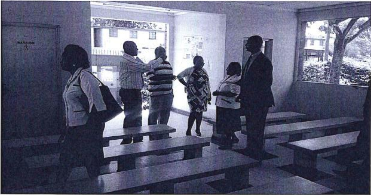
A tour of the facility by the Health Services Committee Members