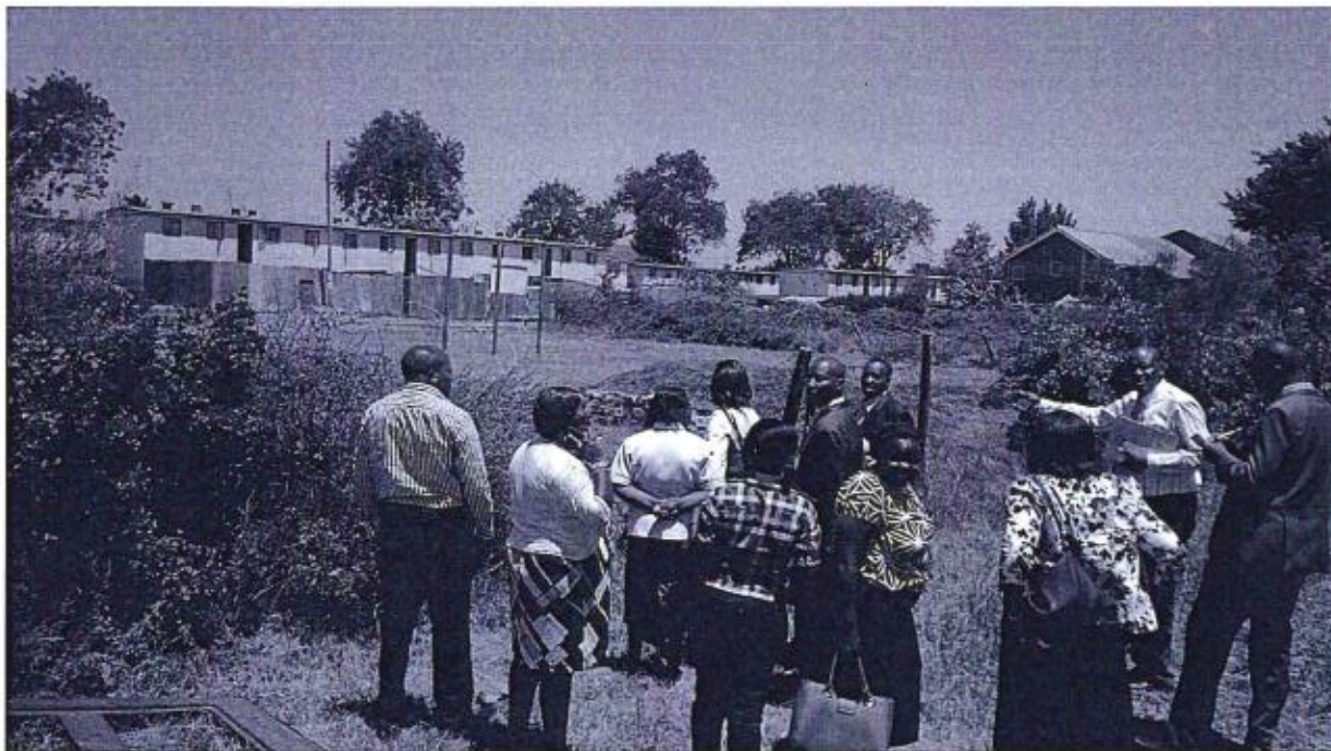
Members at the alleged grabbed land belonging to the Jericho health facility