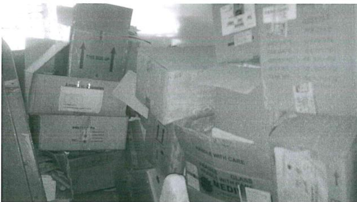
Obsolete items in the School Health Building awaiting auditing before disposal