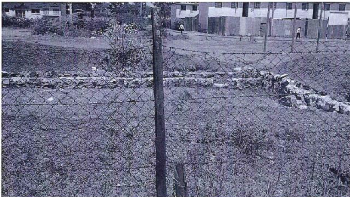
The alleged grabbed land. Note the foundation construction started by the grabber(s)