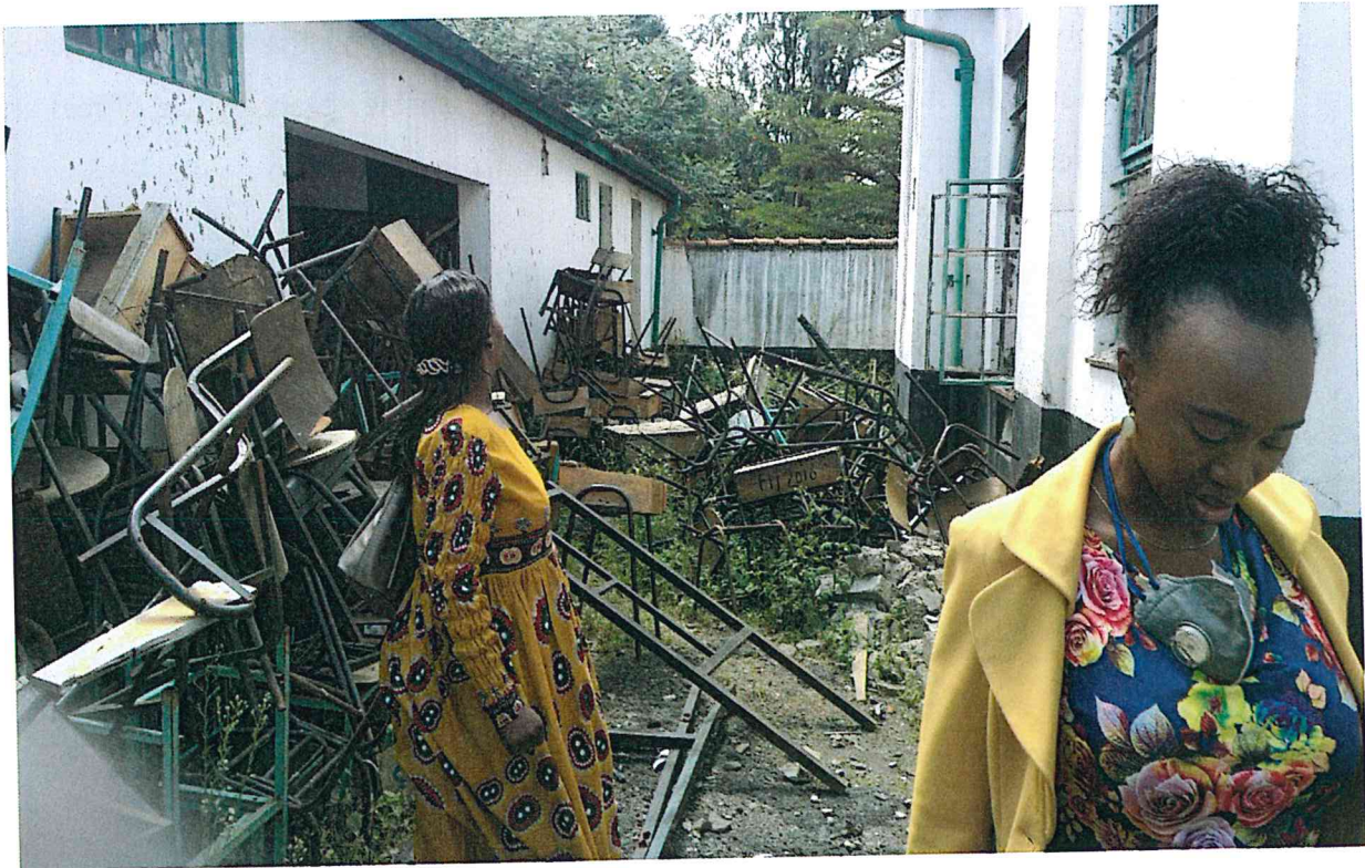
Part of the Centre in a dilapidated state