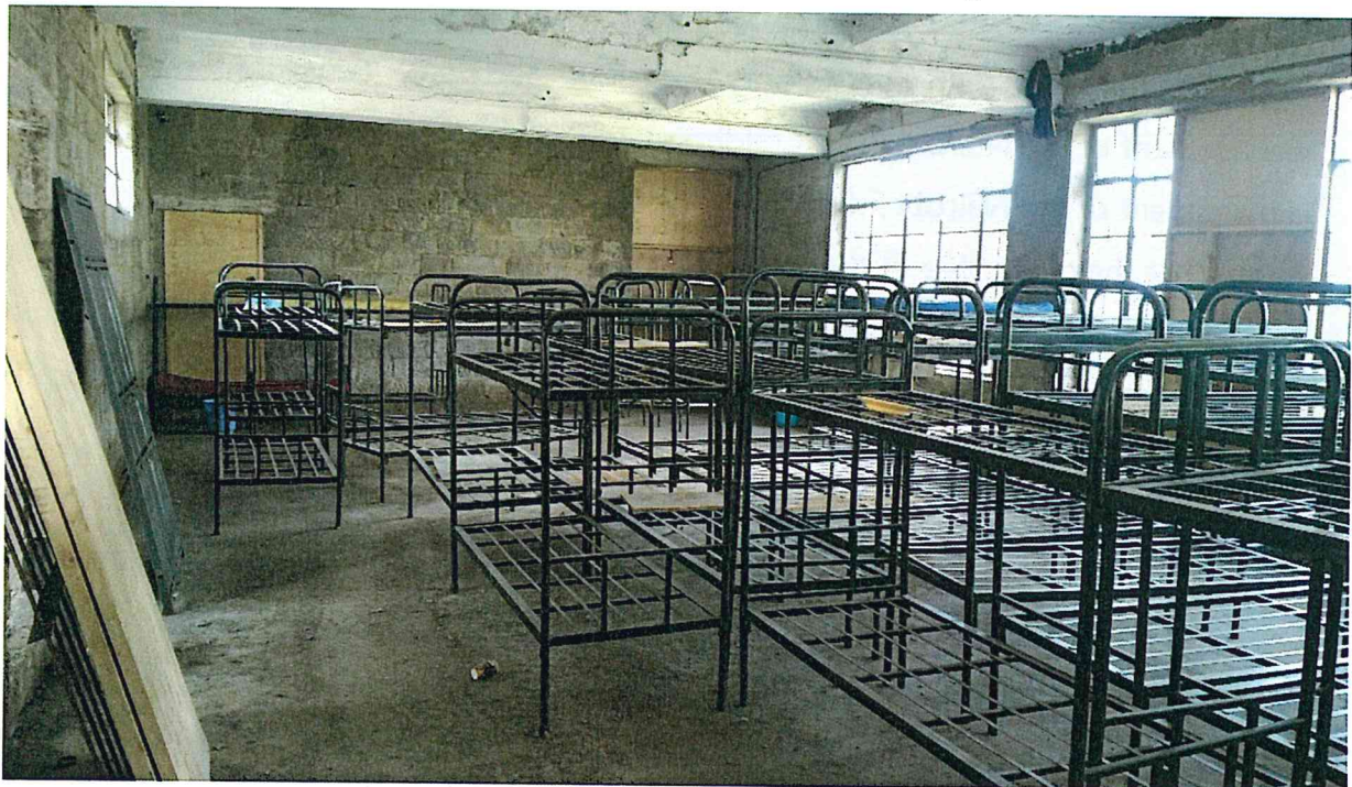
Part of the burnt kitchen converted into a dormitory