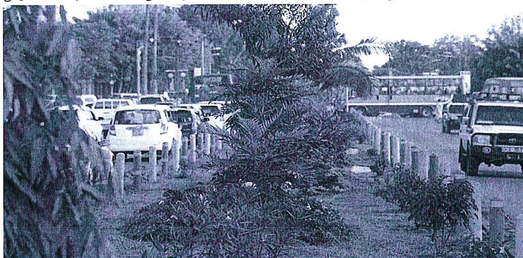
Fig. 3: Part of Uhuru Highway under the Beautification program